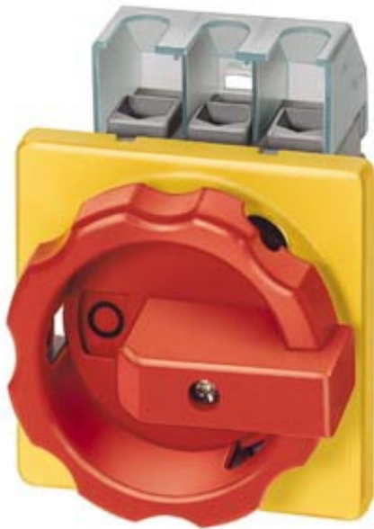
MAIN CONTROL SWITCH 3-POLE IU=25, P/AC-23A AT 400V=9,5KW FRONT MOUNTING CENTRAL- HOLE MOUNTING ROTARY ACTUATOR BLACK