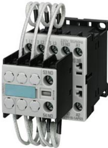
CAPACITOR SW. CONTACTOR, AC-6, 12.5KVAR/400V, 24V, 50/60HZ, 3-POLE, SIZE S00